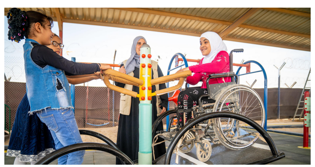
In 2018, UNICEF opened the first fully inclusive playground for children with disabilities in Jordan in Za'atari Refugee Camp as part of national efforts to make education inclusive for all children.

The Guidelines can be used by UN personnel in all their communications, when they send emails and meeting notes, prepare documents, participate in community consultations, communicate through digital platforms, or run multi-channel campaigns that exploit a range of media. Supported by best practices and examples, they provide guidance on how to respect disability etiquette and create inclusive and accessible content.